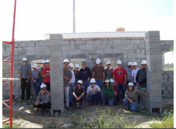
Seminole Ridge students showing the work they have done on the Ticket Building up to the tie beam elevation 12-2007