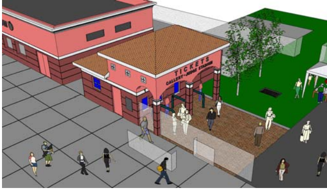
Rendering of the proposed Seminole Ridge HS Ticket Building and Athletic Storage Building to be built on the school campus (drawing by David Porter)