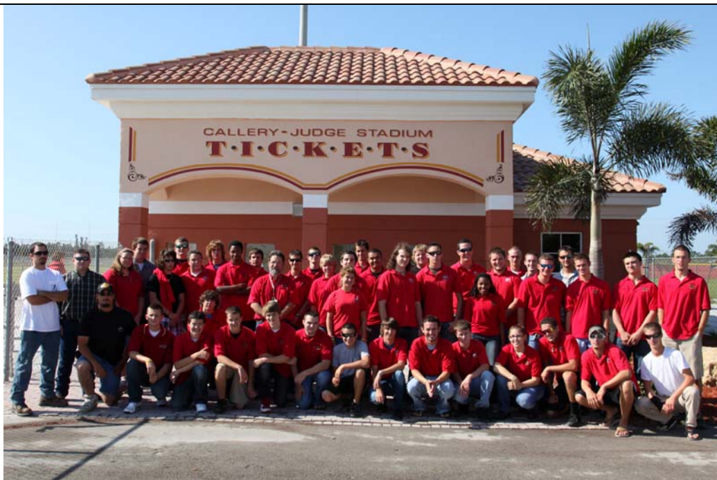
Completed project April 2010