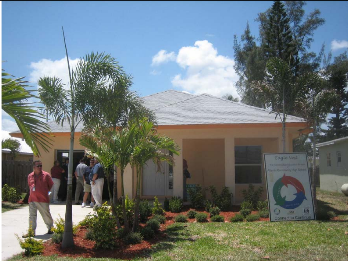
Atlantic HS "Eagle Nest" house ribbon cutting April 28, 2009