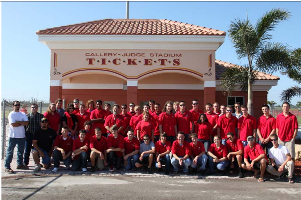
Completed project April 2010